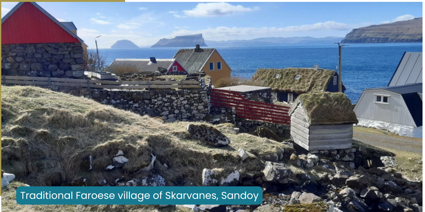
Traditional Faroese village of Skarvanes, Sandoy

opportunities for crofting and to discuss minority language issues. The day will end with a Gaelic musical ceilidh, celebrating the island's rich traditions.