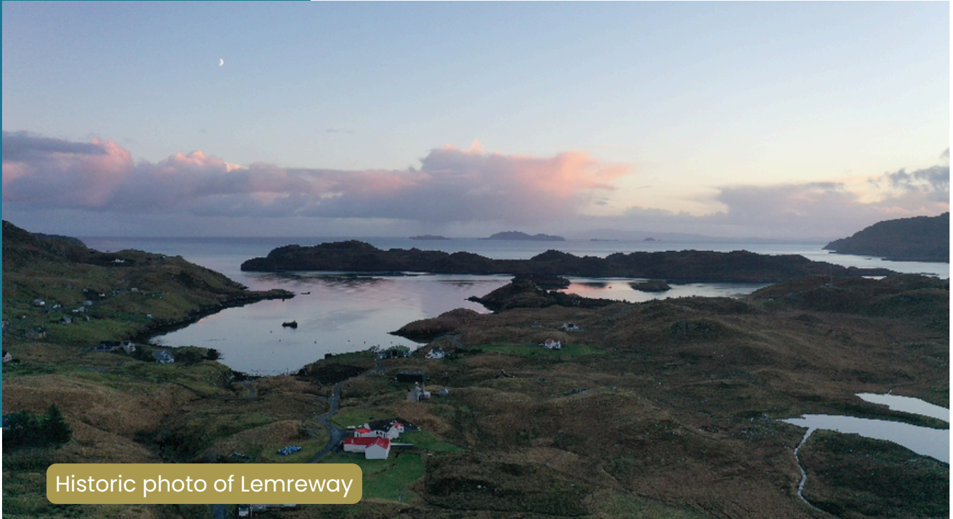
Historic photo of Lemreway