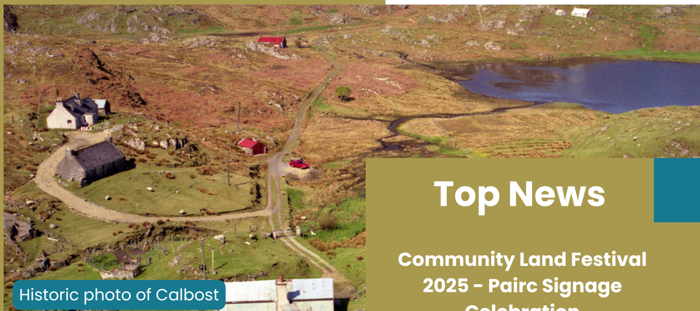
Historic photo of Calbost